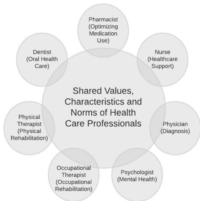
Figure 1. Common and Distinctive Values, Characteristics and Norms of Healthcare Professionals.

should unify pharmacists by focusing on a set of common attributes, values, and norms that contribute to the delivery of high-quality pharmaceutical care, products, and services that are needed to fulfill the Quadruple Aim. 38